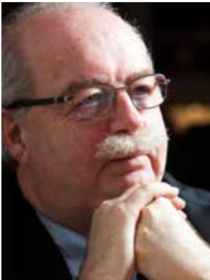
Christophe de Margerie, Former Chairman & CEO, TOTAL S.A.

Lifetime Achievement Honorary Award for the Advancement of International Energy Policy & Diplomacy: