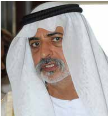
His Excellency Sheikh Nahayan Mabarak Al-Nahayan, Minister of Higher Education and Scientific Research, United Arab Emirates