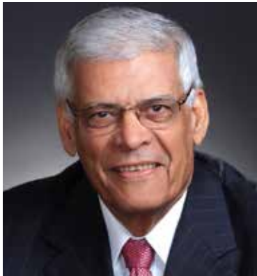
His Excellency Abdalla Salem El-Badri, OPEC Secretary General