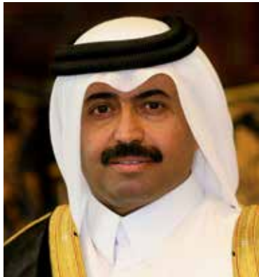
His Excellency Dr. Mohammed Bin Saleh Al-Sada, Minister of Energy and Industry, Qatar & Chairman of the Board of Qatar Petroleum