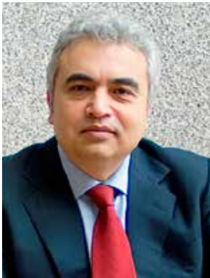
Dr. Fatih Birol, Chief Economist & Director of Global Energy Economics, International Energy Agency (IEA)

Lifetime Achievement for the Advancement of Producer- Consumer Dialogue: