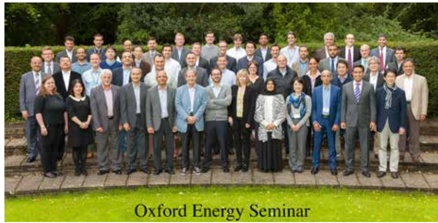
Oxford Energy Seminar