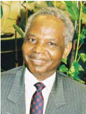
Dr. Rilwanu Lukman, Former OPEC Secretary General and Nigerian Minister of Petroleum